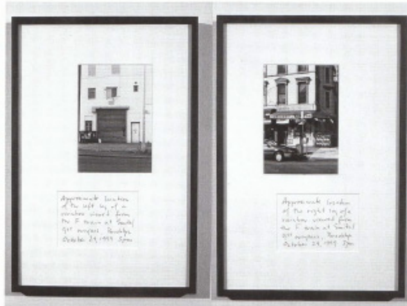
SPENCER FINCH, RAINBOW (BROOKLYN), 2001, 2 black and white photographs with text, 18 x 12" each/