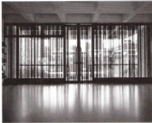
SPENCER FINCH, MOONLIGHT (LUNA COUNTE, NEW MEXICO, JULY 13, 2003) , 2003, filters, tape, variable dimensions, installation view Barbican Center London / MOONLIGHT (LUNA COUNTE, NEW MEXICO, 13. JULI, 2003) , Lichtfilter, Klebstoff, Masse variabel, Installationsansicht.

The third reason for Finch's importance, however, is that for all these critical tendencies, the finished work remains as absurd as the ridiculous challenges and journeys that Finch undertakes to make it. Previous artists might have explored similar territory—Mel Bochner in his Measurement series and John Baldessari in his early 1970s treatment of color—but Finch's work is even more quirky. What's more, no matter how much it deconstructs vision and emphasizes the distance between a source image or experience and its own material appearance, the work is always a visual pleasure, a joy to behold.