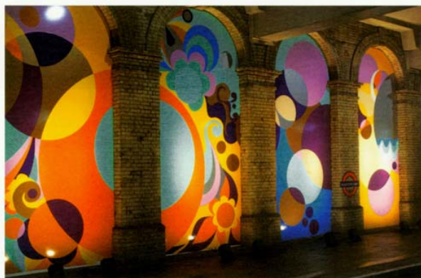
Beatriz Milhazes, "Peace and Love" Road Station Project Platform for Art London Underground, London, UK, 2005 Vinyl adhesive on aluminum – 19 arcs, 196.8 x 78.7 in / 500 x 250 cm each

BM The first thing is that I need time. I could not be on the road doing my work. Every medium has different possibilities of time and that's why I wanted to separate my studios. Because collage, painting, computer... they have completely different working schedules. For painting I really need time to make it happen. It's happening in a good, peaceful, slow way. Introducing new things... Listening to the work... All these require time. Because you need to listen to the canvas, too. You cannot just impose things on