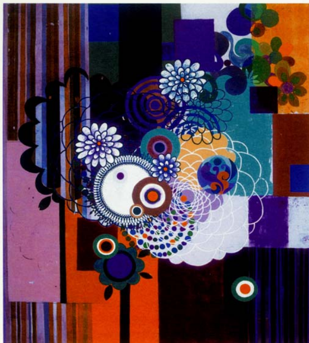
Beatriz Milhazes, Panamericano , 2004 Acrylic on canvas, 77.9 x 70.4 in / 198 x 179 cm

Collection: Claudia e Jay Khalifeh, São Paulo