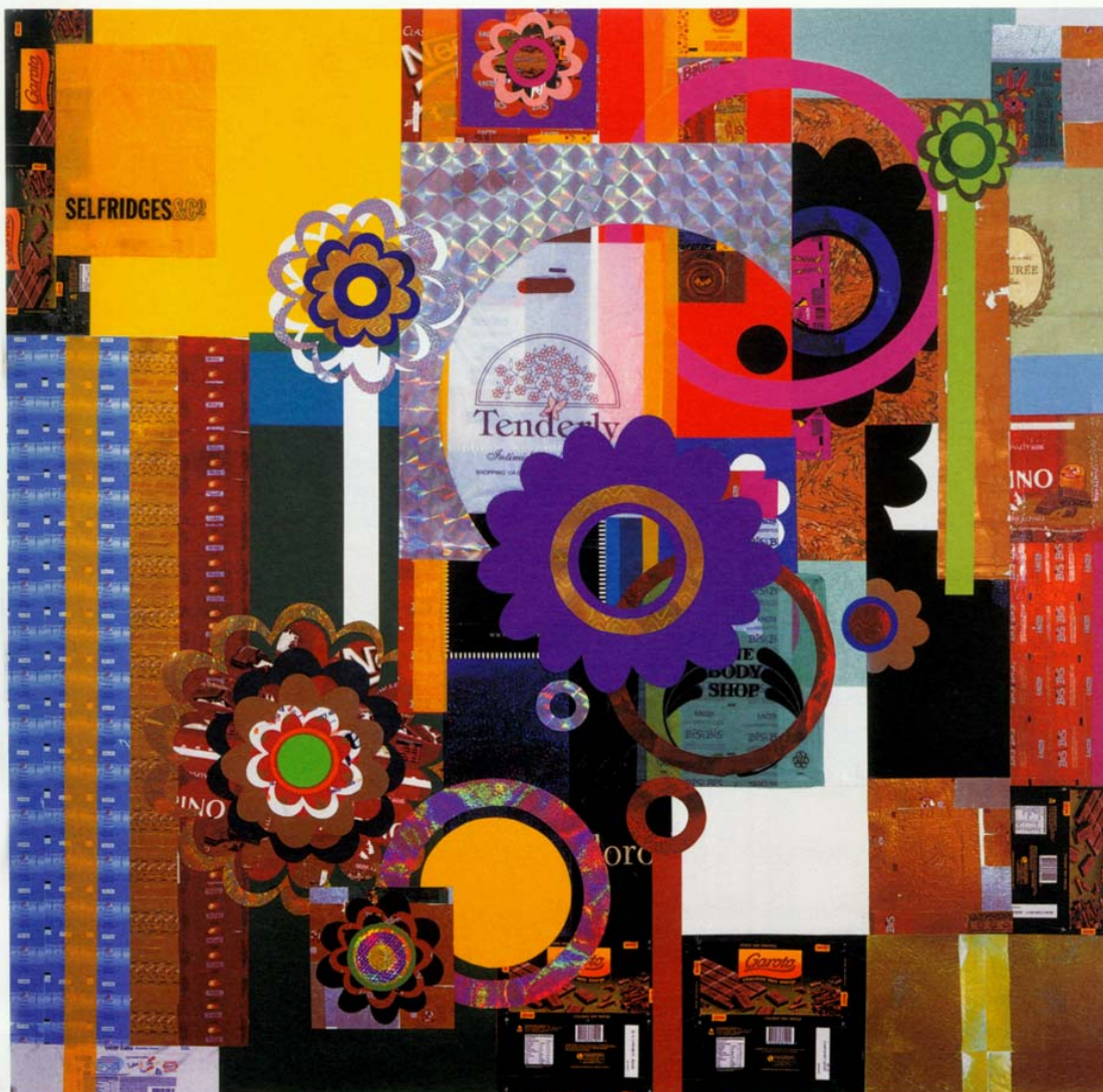
Beatriz Milhazes, Bala de Leite, 2005 Mixed collage on paper, 62 x 58 in / 157.5 x 147.5 cm