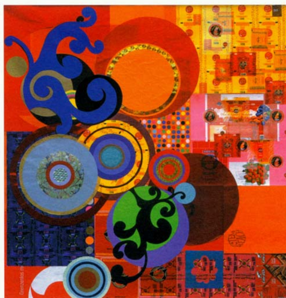
Beatriz Milhazes, Duro Branco , 2006 Mixed collage on paper, 61.2 x 58.4 in / 155.5 x 148.5cm

BM True. At the beginning, my work was neither directly interested in nor connected to it, but it certainly bore the effects of the Brazilian folk culture in a plastic way, on the visual result. It took some time before I arrived at the things I actually wanted to make. When I was at school, I wanted to establish a link between my culture and what I had always been and the painting. I think that was the greatest challenge, because painting is a serious undertaking; and back then, to be a serious painter, the work always had to be associated with meaning originating from Europe, and later on, from the United States, but not from Brazil. Yet for me, Brazil was a zone of meanings, of captions. These did not necessarily have a connection with the outside world. So in my case, I wanted to establish a connection to my work, because in reality, my life and my culture have nothing to do with painting. But how could I connect it in an interesting way? And thus the carnival became a part of it. Because I have always loved the way Brazilian people live it. In Brazil, the carnival develops differently in every state, every place. In reality the carnival is something magnificent. I am not really into carnival; I don't go out on the street and dance. But I have always been a really huge admirer of the way they develop the carnivals and of this freedom they enjoy. They mix completely different things. They always have teams of samba from every school each year.