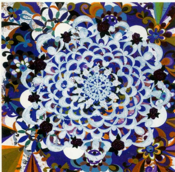
Beatriz Milhazes, O popular , 1999 Acrylic on canvas, 70 x 70.8 in / 178 x 180 cm

Collection: Douglas Andrews, Italy