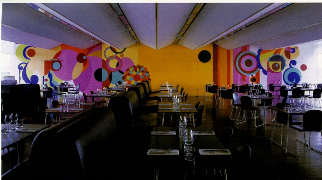
Beatriz Milhazes, "Guanabara", Tate Modern Restaurant Project.