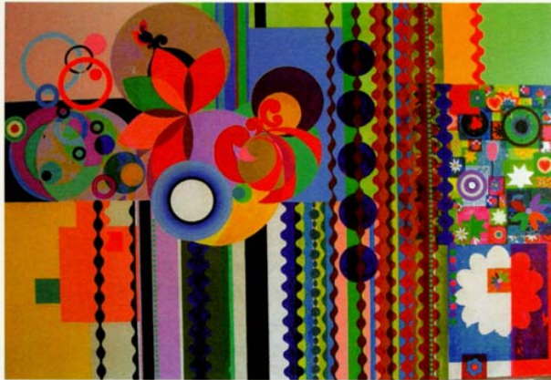
Beatriz Milhazes, Dancing , 2007 Acrylic on canvas, 97.2 x 137.7 in / 247 x 350 cm

Collection: Pinacoteca do Estado de São Paulo