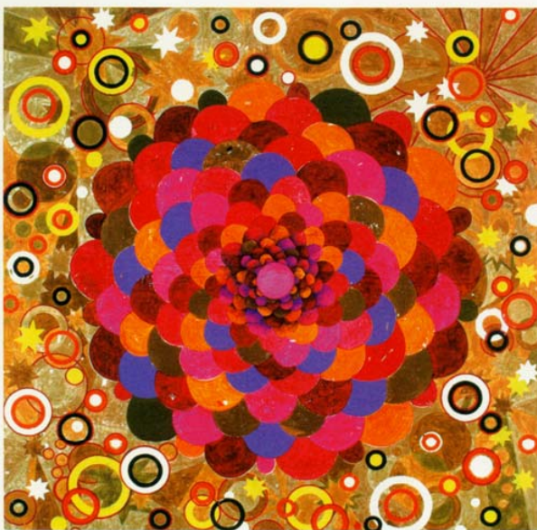
Beatriz Milhazes, Nega Maluca , 2006 Acrylic on canvas, 98.2 x 98.6 in / 249 x 250.5 cm

Collection: Douglas Andrews, Italy