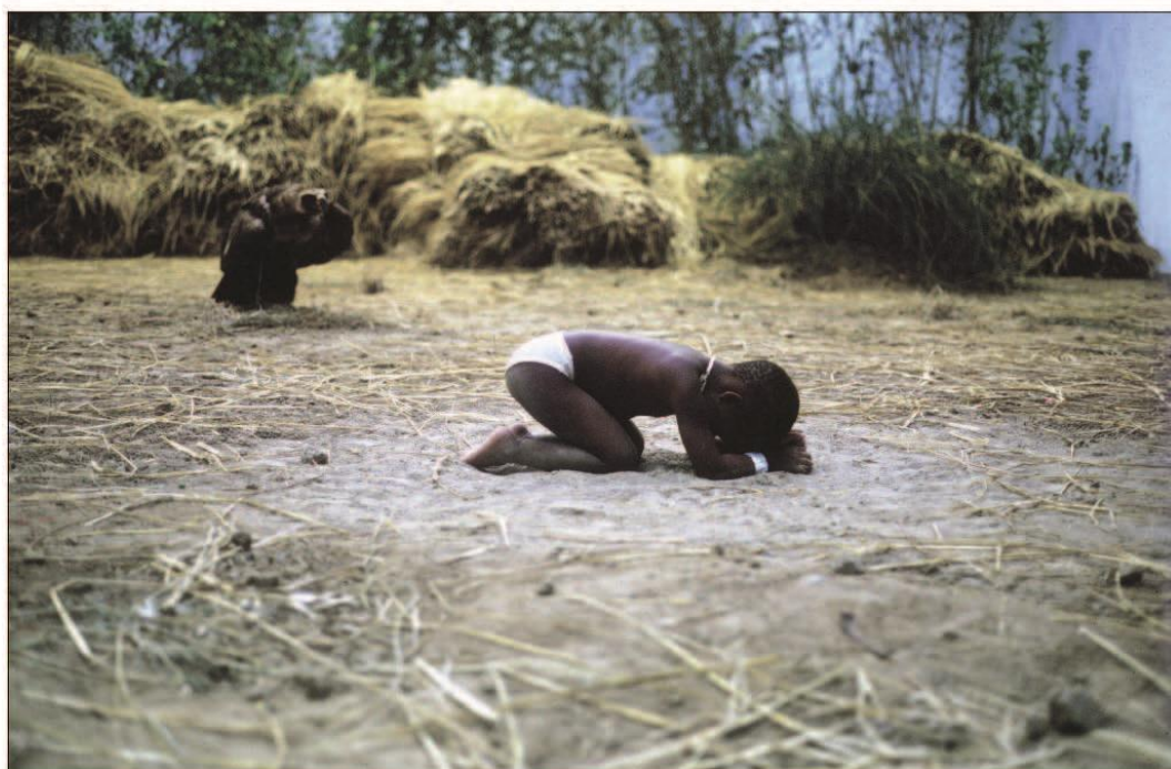
BELOW The Starving of Sudan , 2008, installation in Long March Space based on a photograph by Kevin Carter.

THIS PAGE AND OPPOSITE ©XU ZHEN/COURTESY, JAMES COHAN GALLERY, NEW YORK, SHANGHAI (3)