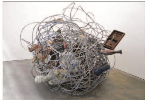
Things I see every morning when I wake up and think of every night before I sleep, 2009.

"Xu Zhen's work is political to the extent that he is always pushing boundaries," says Groom. "He knows he is operating in that context where those boundaries are strictly policed and is always on the edge of them." Meanwhile, Madeln