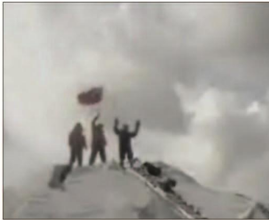
LEFT Video still from 8.848-1.86 .