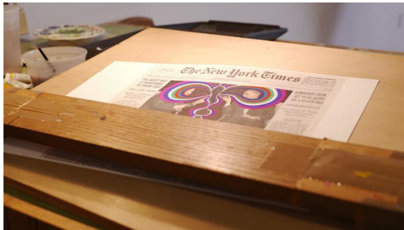
A New York Times piece in progress.