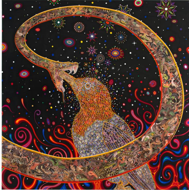
This is "Penetrators" a mixed media piece on wood panel that will also be a part of the "Current Events" show