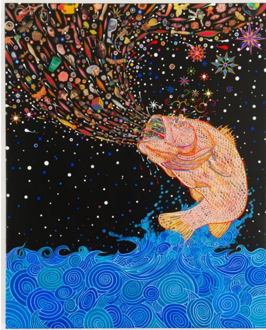
That is the study for "Gyre" my favorite painting in this show