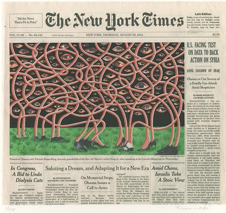
Aug. 29, 2013, 2014 Screenprint on archival inkjet print 12 x 10 3/4 in