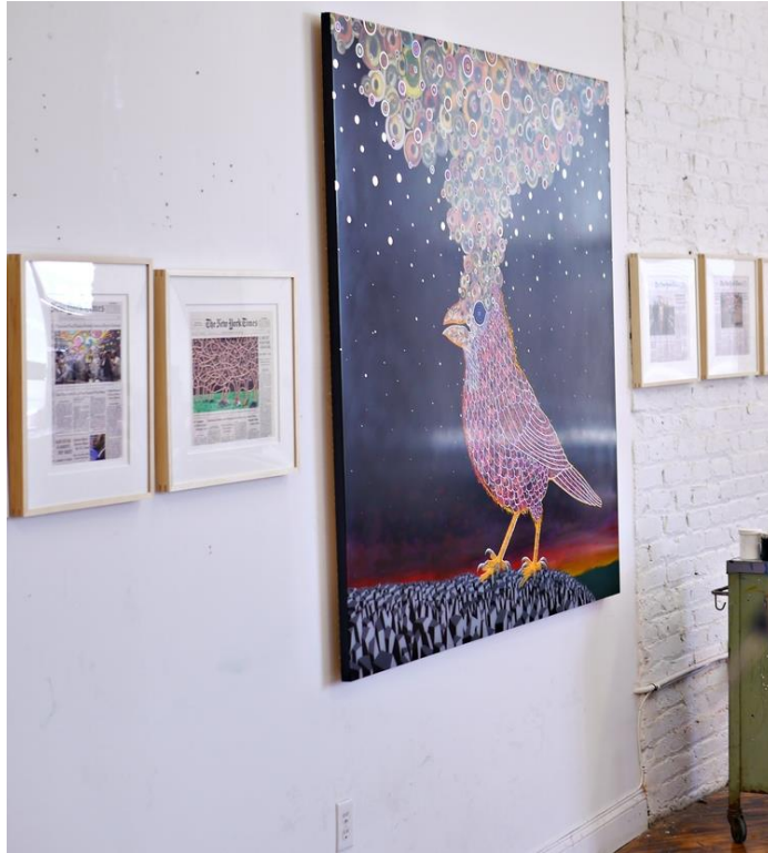
Some of the New York Times "collaborations" flank a large painting that also will be at the show.

The selection of the images that will actually become a collage and a part of The New York Times series happens after Tomaselli studies some of the front pages for a while (he has been archiving all of them since 2005) and revisits them a few times until he feels that they have what it takes to become true art.