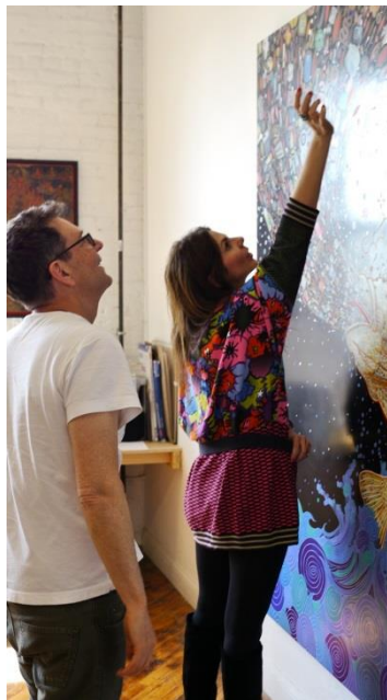
I even felt compelled to touch it. Gently, of course.