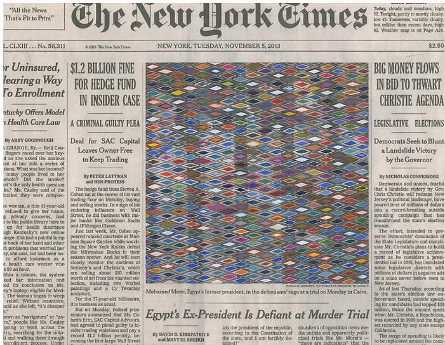
Nov. 5, 2013, 2014 Gouache and archival inkjet print on watercolor paper