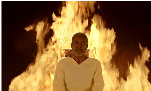
Martyrs by Bill Viola at St Paul's in London.

Forget the bloody martyrdoms and hot pincers ... Viola's glorious new video installation is a hi-tech Caravaggio that redefines religious art