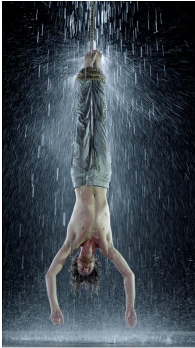
Water ... Martyrs by Bill Viola

Martyrs is a study in suffering and redemption. Four people on four vertical screens undergo extreme fates: one has been buried, another hangs with her wrists and ankles bound, another sits amid flames and a fourth hangs upside down as he is drenched in cascades of water. As these images develop and transform in parallel, it becomes hard to know what is death and what is hope. Soil is whirled off the buried man in an upward band of dust, like the zip in a Barnett Newman painting, until he is born again, looking up into heavenly light. Similarly, the suspended woman endures her pain to raise her eyes to that light in a final deathly pose of triumph.