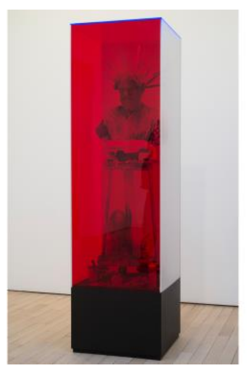
Folkert de Jong, The Last Nation, 2014