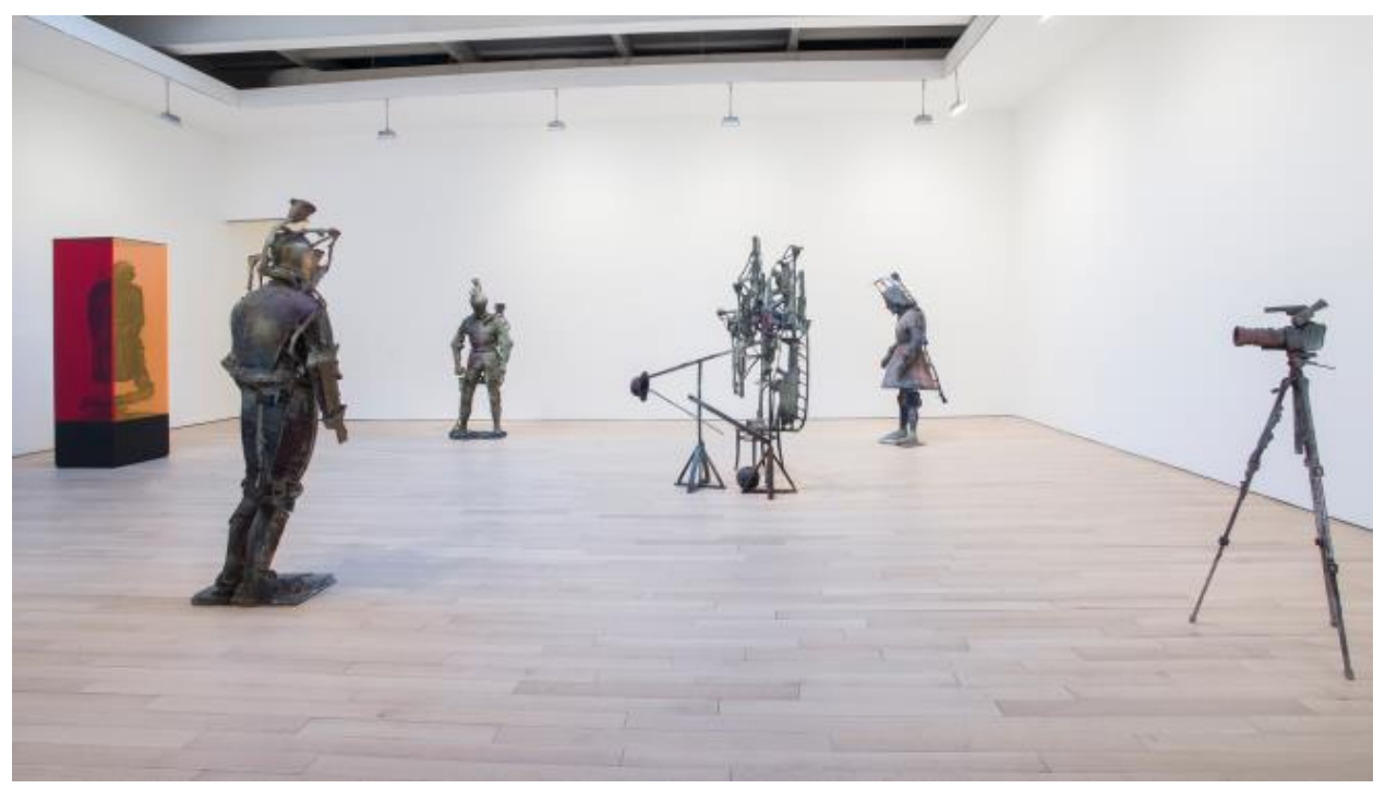
Installation view of Folkert de Jong, "The Holy Land"

The plastic cases contain figures made of pigmented polyurethane—among them a spectral, hooded presence evoking the Grim Reaper. They're also surrounded by junk like electric fans and spray cans that seem to reference both home and studio. Ultimately, De Jong's title evokes less of a place than the destination for a crusade, winding its way past life's dead ends.— Paul Laster