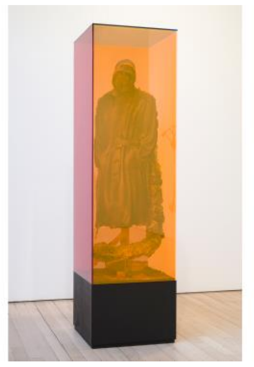
Folkert de Jong, The Knights Move, 2014