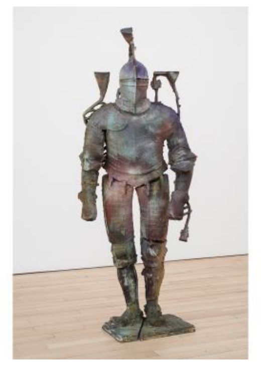
Folkert de Jong, Old DNA, 2014