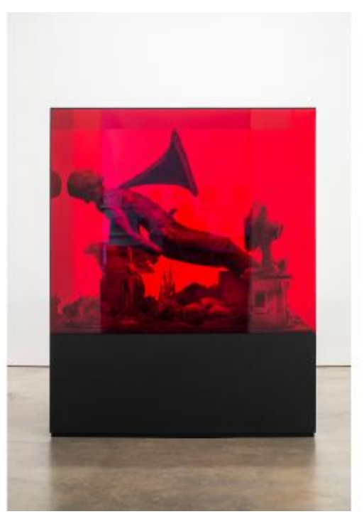
Folkert de Jong, The Eye of Jupiter, 2014