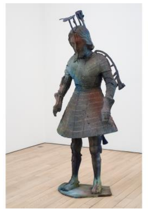
Folkert de Jong, From Stately Throne, 2014