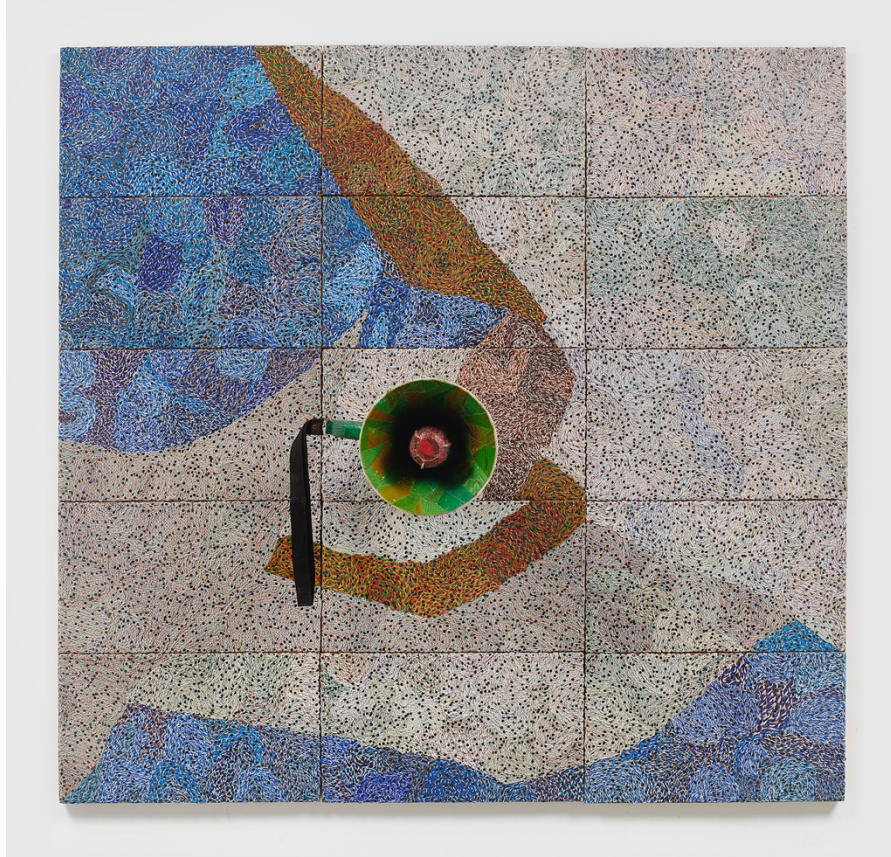
Elias Sime, TIGHTROPE: ECHO!? , 2020, Reclaimed electrical wires and components on panel, 45 x 48 x 12 1/4 in (114.3 x 121.9 x 31.1 cm)

Elias' Tightrope: ECHO!? works are about this dichotomy, hope and fear of repeating history. He expressed these feelings in Tightrope: ECHO!? YELLOW , the megaphone is amplifying in the center and Elias colorfully constructed the sound with a yellow and brown form. Elias has said "The form is a speech bubble. Some speakers amplify hope. During stressful times, hope can capture the majority. Because we are overwhelmed with lies and innuendos, we tend to doubt the hopeful truth. I added the brown to show a diluted hope. What keeps us moving forward is hope even when we question it." The red portrait-like figures on each side of the megaphone seem to eagerly pay attention to what is being said. Elias said, "Depending on the messenger and the message, mega-phones can be useful tools. They are simple and mobile often used during political rallies, religious events, and the likes. They are meant to amplify individual ideas and influence thoughts. The loudness of the sound and the frequency of the speaker's chosen words, can be influential thus expanding the echo."