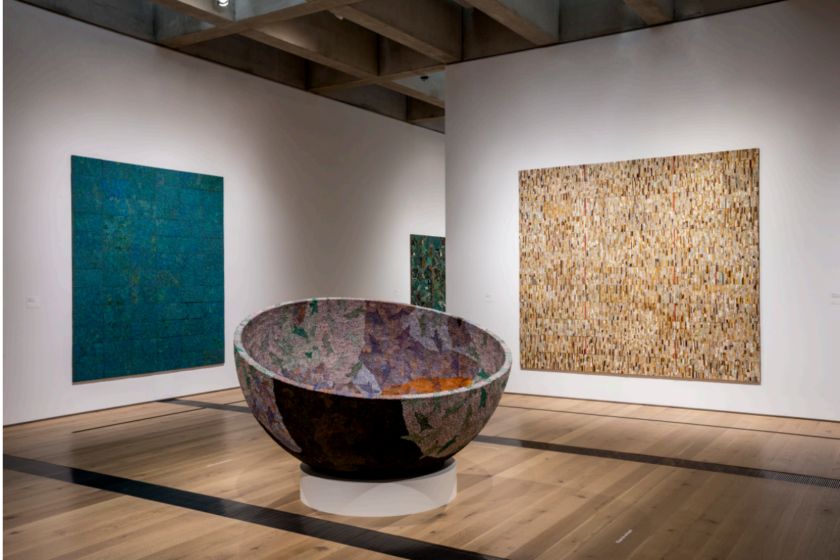
Installation view, Elias Sime, Currents 118: Elias Sime , Saint Louis Art Museum, July 31, 2020 – January 31, 2021

Elias' recent solo exhibition at the Saint Louis Art Museum includes two large, inverted half globes, covered with woven electrical wires. One of these half globes is entitled Tightrope: EYES and EARS of a Bat (2020). He said, "Bats hang upside down. To a casual observer, this unusual standing position is discomfoting. To the bats, it is their natural position. I often wonder if the hollow shape of the caves' interior is what gives the bats a sense of comfort. Similarly, the ideas amplified through megaphones can be comfortable to some and disturbing to others." These half globe pieces, influenced by the Native American Cahokia Mounds and the St. Louis Gateway Arch, are about humanity's urge to let the future generations know that they were there. Just like these monuments, ideas amplified through the megaphone can impact many generations into the future.